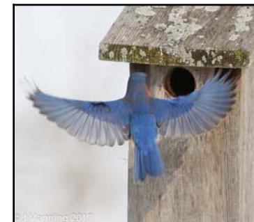
Eastern Bluebird Upper Macatawa Natural Area

The preserve is located directly across from Eastern Grand River Park and is accessible only by boat.